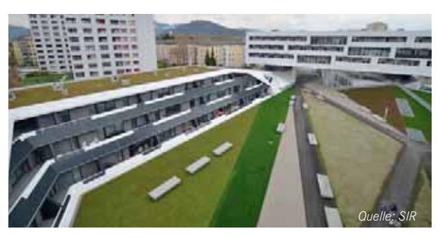
The "Parklife" project, an old people's home combined with an apartment block for young families, is a European showcase project in the category energy-efficient sustainable construction using solar power. The planning for this was commissioned as part of a EUROPAN competition for young architects.

On premises once occupied by the municipal utilities company, 287 apartments for rental, the new city gallery, a student hostel and a nursery school have been built. The existing office block has been renovated and equipped with modern offices, laboratories