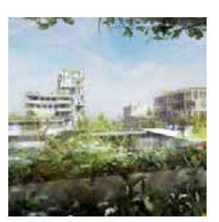
Diversifying open spaces in Liesing Mitte "Garteln Hoch 3 / In der Wiesen Ost'

step by step to zero emissions by 2050, to lower energy and raw-material consumption by a factor of 10 and to shift to 100 % renewables as sources of energy. Social considerations, such as making these innovations affordable for low-income households, play a key part here. Around one hundred different individual projects have been slotted into a road map. Designing the open spaces as areas which the future residents can use is an important aspect. Urban farming projects in subsidized housing construction are intended to improve the quality of the surroundings, avoid people moving to the country and re-establish their awareness of what makes good food. \blacksquare